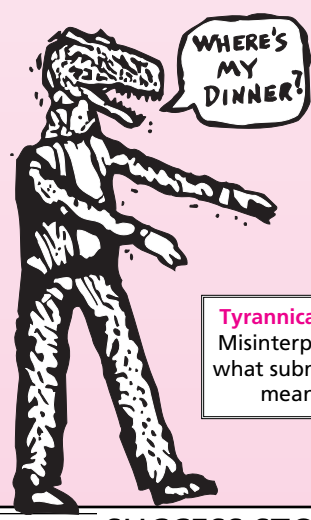
Tyrannical Rex: Misinterpreting what submission means.

"I have a brain and a uterus and I use them both." Patricia Schroeder