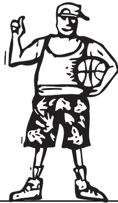
PEER PRESSURE: HIGH SCHOOL