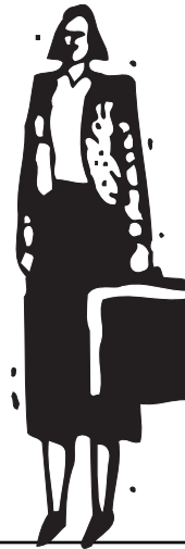
PEER PRESSURE: CORPORATE