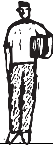
PEER PRESSURE: COLLEGE